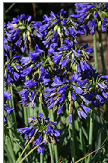
Ever Midnight Agapanthus flowers