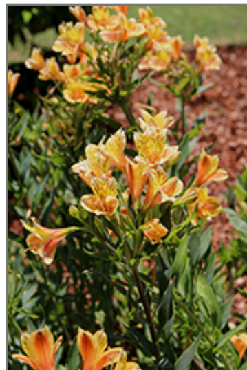
Summertime Alstroemeria flowers