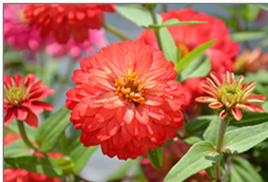
Dreamland Coral Zinnia flowers