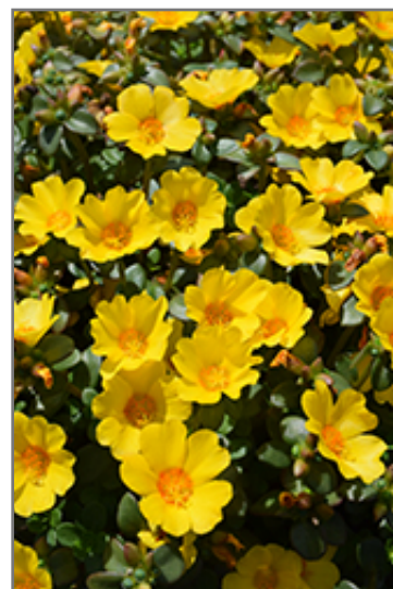
Pazzaz Nano Gold Portulaca flowers

Pazzaz Nano Gold Portulaca is recommended for the following landscape applications;