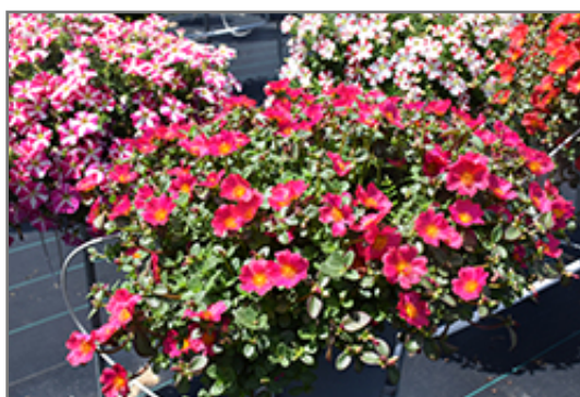
Pazzaz Nano Fuchsia Portulaca in bloom