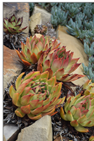
Red Tip Echeveria

Red Tip Echeveria is recommended for the following landscape applications;