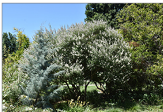
Albus Chaste Tree in bloom