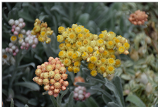
Ember Glow Strawflower flowers