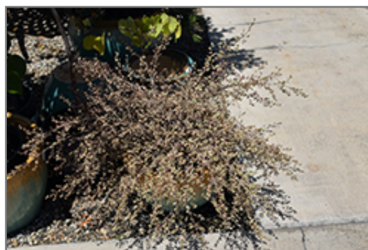
Little Star New Zealand Myrtle