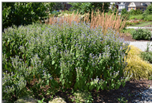
Hoary Skullcap in bloom

This plant is not reliably hardy in our region, and certain restrictions may apply; contact the store for more information.