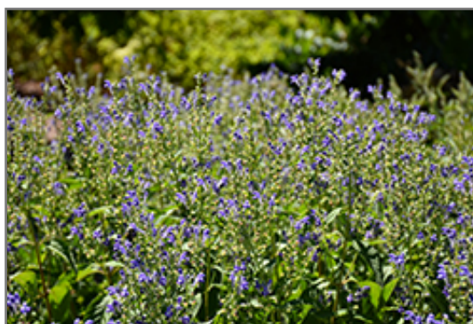
Hoary Skullcap flowers