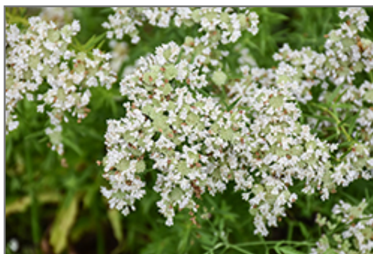
Narrow Leaf Mountain Mint flowers

This is a relatively low maintenance plant, and should be cut back in late fall in preparation for winter. It is a good choice for attracting bees and butterflies to your yard, but is not particularly attractive to deer who tend to leave it alone in favor of tastier treats. Gardeners should be aware of the following characteristic(s) that may warrant special consideration;