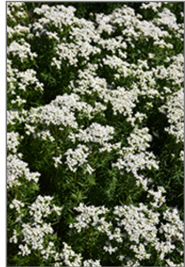
Narrow Leaf Mountain Mint flowers

This plant is not reliably hardy in our region, and certain restrictions may apply; contact the store for more information.