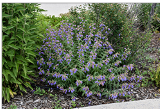
Richardson's Beard Tongue in bloom