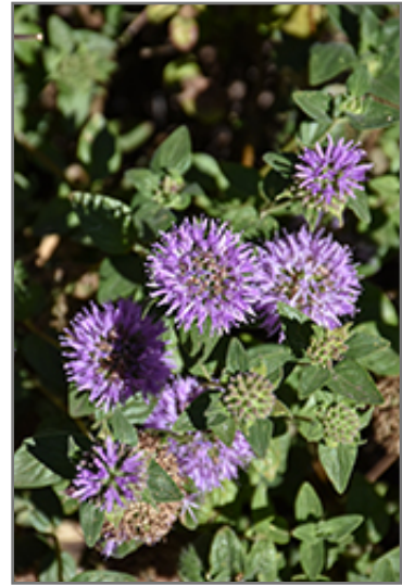
Coyote Mint flowers