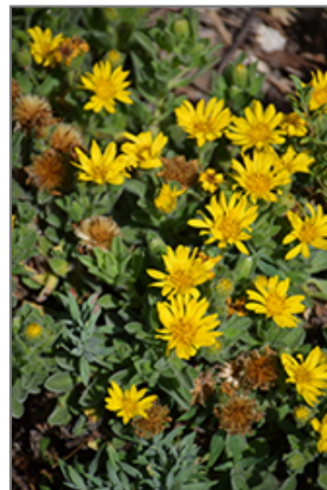
San Bruno Mountain Golden Aster flowers