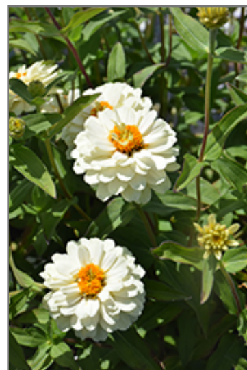
Zydeco White Zinnia flowers

Zydeco White Zinnia is recommended for the following landscape applications;