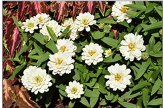
Zydeco White Zinnia flowers

Zydeco White Zinnia will grow to be about 16 inches tall at maturity, with a spread of 20 inches. When grown in masses or used as a bedding plant, individual plants should be spaced approximately 14 inches apart. Its foliage tends to remain dense right to the ground, not requiring facer plants in front. This fast-growing annual will normally live for one full growing season, needing replacement the following year.