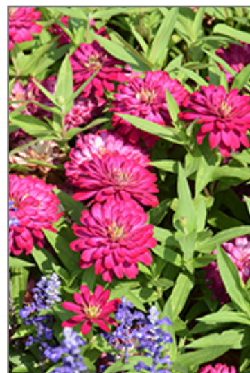
Zydeco Cherry Zinnia flowers