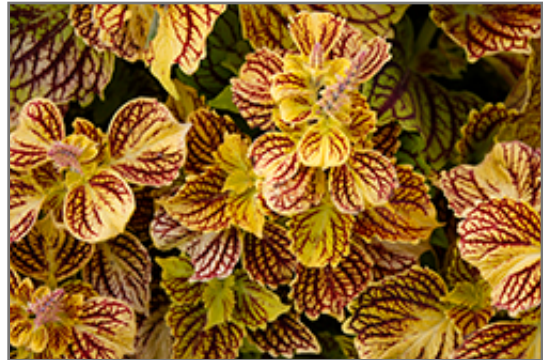
Main Street Venice Boulevard Coleus foliage

Main Street Venice Boulevard Coleus is recommended for the following landscape applications;