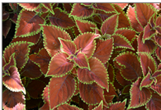
Talavera Sienna Coleus foliage

Talavera Sienna Coleus is recommended for the following landscape applications;