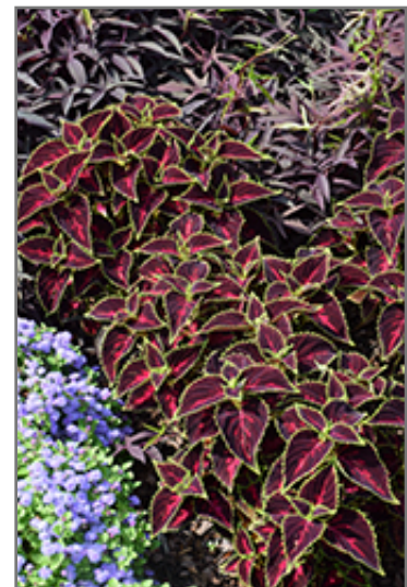
Talavera Pink Tricolor Coleus