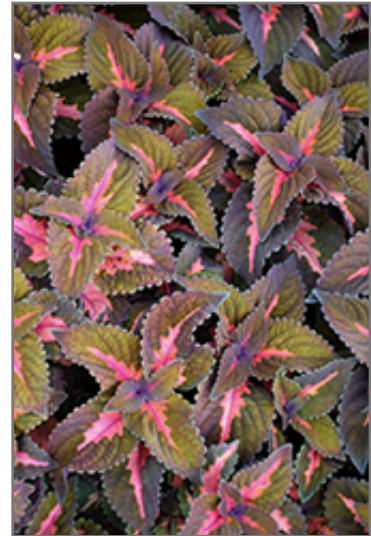
Main Street Sunset Boulevard Coleus foliage

Main Street Sunset Boulevard Coleus is a fine choice for the garden, but it is also a good selection for planting in outdoor containers and hanging baskets. It is often used as a 'filler' in the 'spiller-thriller-filler' container combination, providing a canvas of foliage against which the larger thriller plants stand out. Note that when growing plants in outdoor containers and baskets, they may require more frequent waterings than they would in the yard or garden.