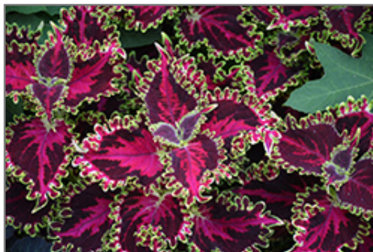
Volcanica Solar Flare Coleus foliage

Volcanica Solar Flare Coleus is recommended for the following landscape applications;