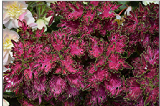
Wildfire Smoky Rose Coleus foliage