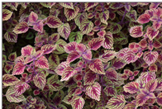
Great Falls Rose Gold Coleus foliage

Great Falls Rose Gold Coleus is recommended for the following landscape applications;