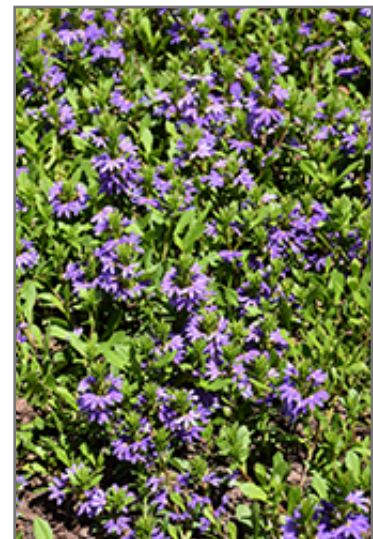
Bombay Compact Dark Blue Fan Flower flowers