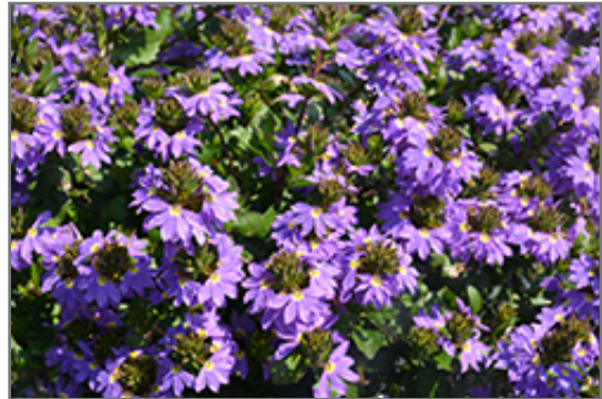
Bombay Compact Dark Blue Fan Flower flowers

Bombay Compact Dark Blue Fan Flower is recommended for the following landscape applications;