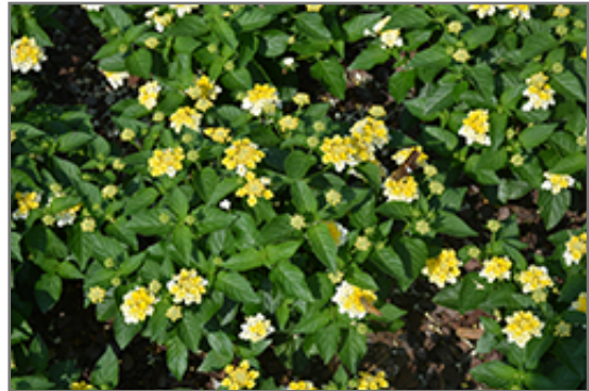
Gem Compact Yellow Topaz Lantana flowers