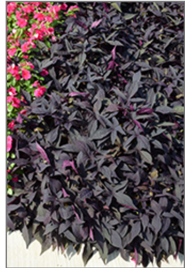
Sweet Georgia Deep Purple Sweet Potato Vine