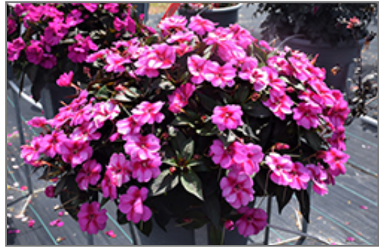
SunPatiens Compact Purple Candy Impatiens in bloom

SunPatiens Compact Purple Candy Impatiens is a fine choice for the garden, but it is also a good selection for planting in outdoor containers and hanging baskets. It can be used either as 'filler' or as a 'thriller' in the 'spiller-thriller-filler' container combination, depending on the height and form of the other plants used in the container planting. It is even sizeable enough that it can be grown alone in a suitable container. Note that when growing plants in outdoor containers and baskets, they may require more frequent waterings than they would in the yard or garden.