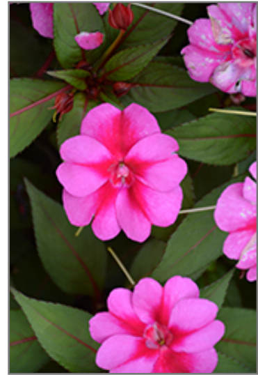
SunPatiens Compact Purple Candy Impatiens flowers

This plant will require occasional maintenance and upkeep, and should not require much pruning, except when necessary, such as to remove dieback. It has no significant negative characteristics.