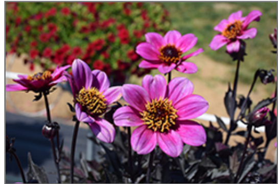
Happy Days Purple Dahlia flowers

Happy Days Purple Dahlia is recommended for the following landscape applications;