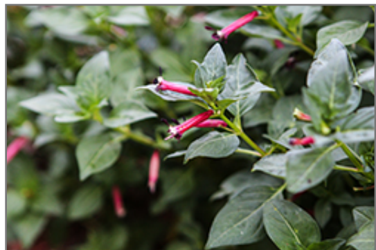
Cubano Cristo False Heather flowers