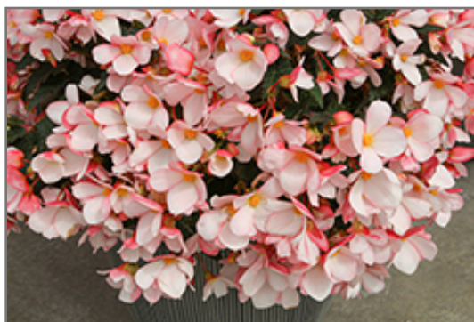
Florencio White Begonia flowers

Florencio White Begonia is recommended for the following landscape applications;