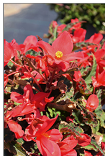
Florencio Cerise Begonia flowers