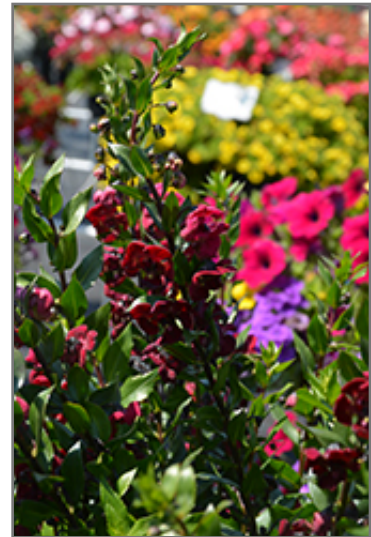
Archangel Ruby Sangria Angelonia flowers