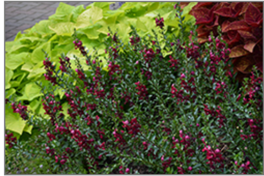
Archangel Ruby Sangria Angelonia in bloom