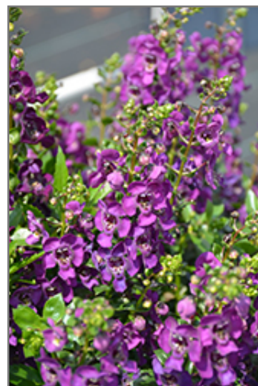
Alonia Purple Angelonia flowers

Alonia Purple Angelonia is recommended for the following landscape applications;