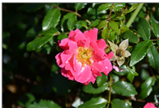
Oso Easy Double Pink Rose flowers