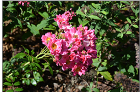
Oso Easy Double Pink Rose flowers

Oso Easy Double Pink Rose will grow to be about 4 feet tall at maturity, with a spread of 4 feet. It tends to fill out right to the ground and therefore doesn't necessarily require facer plants in front. It grows at a fast rate, and under ideal conditions can be expected to live for approximately 20 years.