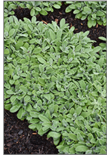
Little Lamb Lamb's Ears

This plant is not reliably hardy in our region, and certain restrictions may apply; contact the store for more information.