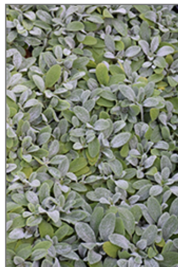
Little Lamb Lamb's Ears foliage

Little Lamb Lamb's Ears is recommended for the following landscape applications;