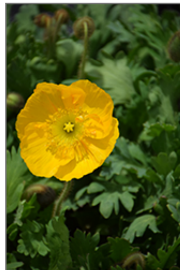
Champagne Bubbles Yellow Poppy flowers