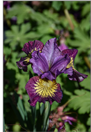
Miss Apple Siberian Iris flowers