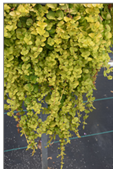
Goldii Creeping Jenny foliage