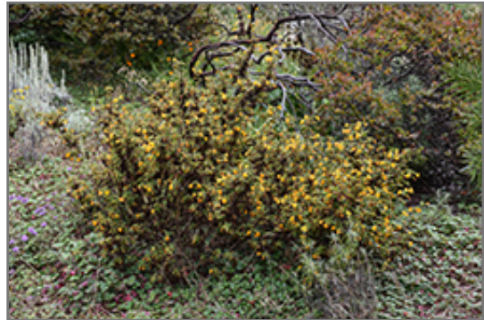
Bush Monkey Flower flowers

This plant is not reliably hardy in our region, and certain restrictions may apply; contact the store for more information.