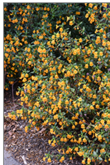
Bush Monkey Flower in bloom

This shrub will require occasional maintenance and upkeep, and should only be pruned after flowering to avoid removing any of the current season's flowers. It is a good choice for attracting bees, butterflies and hummingbirds to your yard, but is not particularly attractive to deer who tend to leave it alone in favor of tastier treats. It has no significant negative characteristics.