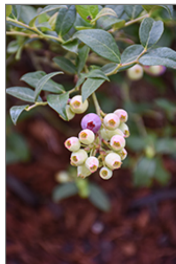
Bountiful Baby Blueberry flowers