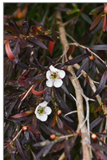
Starry Night Tea-Tree flowers

This plant is not reliably hardy in our region, and certain restrictions may apply; contact the store for more information.