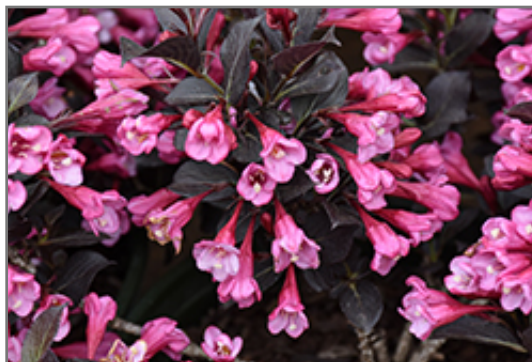
Coco Chill Weigela flowers

Coco Chill Weigela is recommended for the following landscape applications;