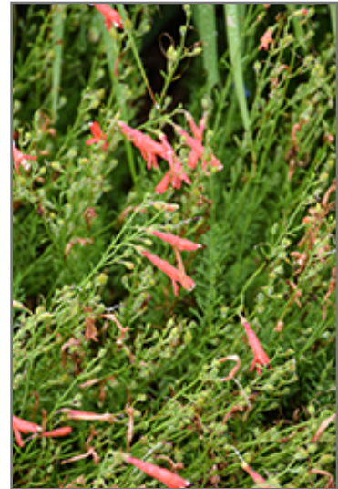
Half Pint Pineleaf Beard Tongue flowers