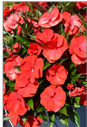
Petticoat True Red Magnum New Guinea Impatiens flowers