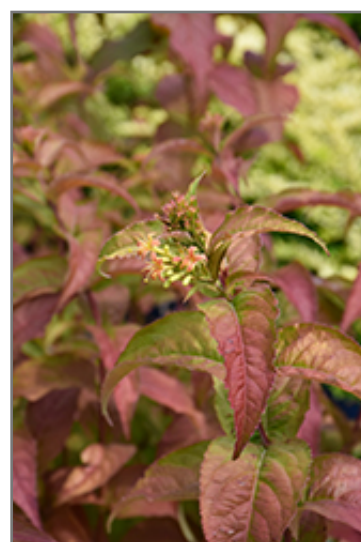
Firefly Diervilla flowers