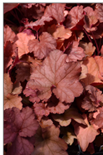
Tayberry Coral Bells foliage