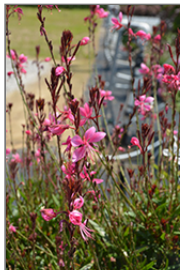
Steffi Dark Rose Gaura flowers

Steffi Dark Rose Gaura is recommended for the following landscape applications;