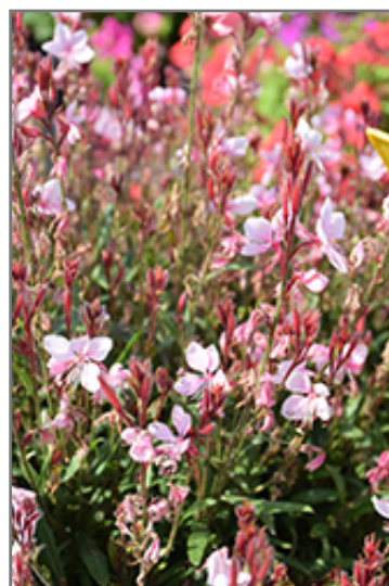
Steffi Blush Pink Gaura flowers