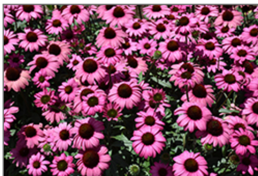
Prima Berry Coneflower flowers

Prima Berry Coneflower is recommended for the following landscape applications;