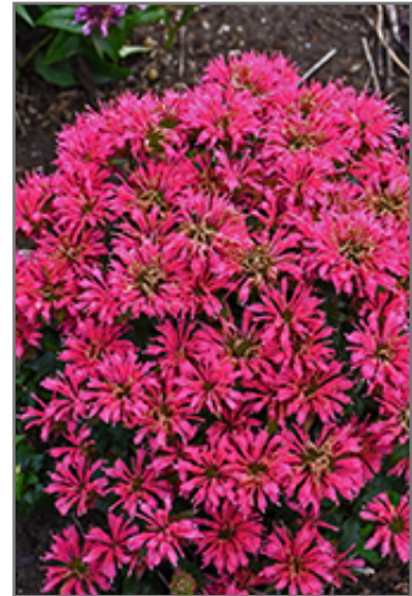
Pardon My Cerise Beebalm flowers